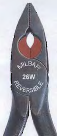
New 26W cushioned throat and black oxide finish