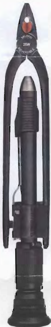
New 25W cushioned throat and black oxide finish

Look for these changes on shipments in late spring 2007. If you have any questions, please contact your local Imperial Tool representative, or call Stride customer service at 1-888-467-8665.