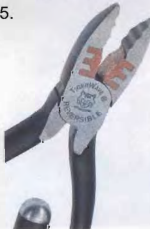
Old 26W Striped throat and buffed jaws